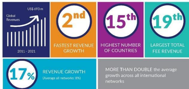
Growth Rate vs Top 20 Networks - Regional Rankings